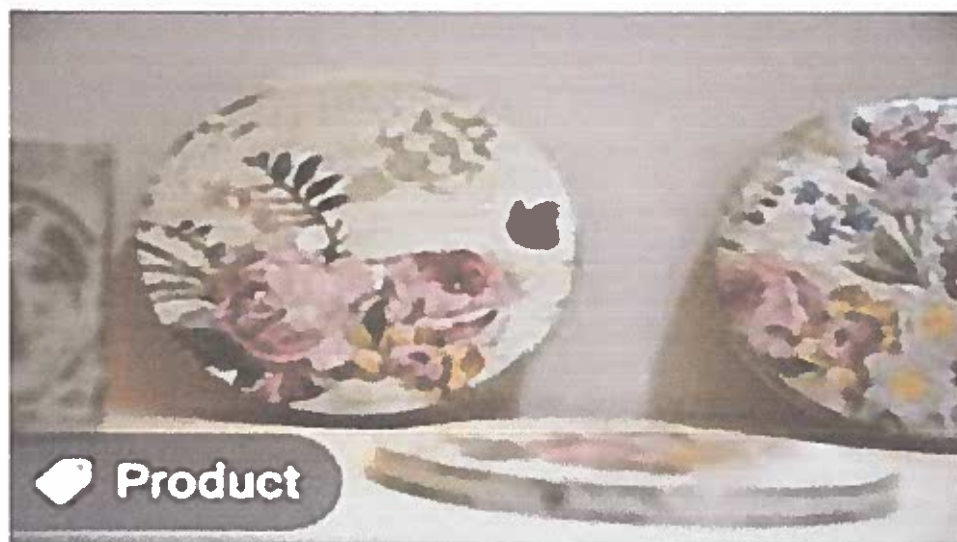
Photos of Decoupage Arts